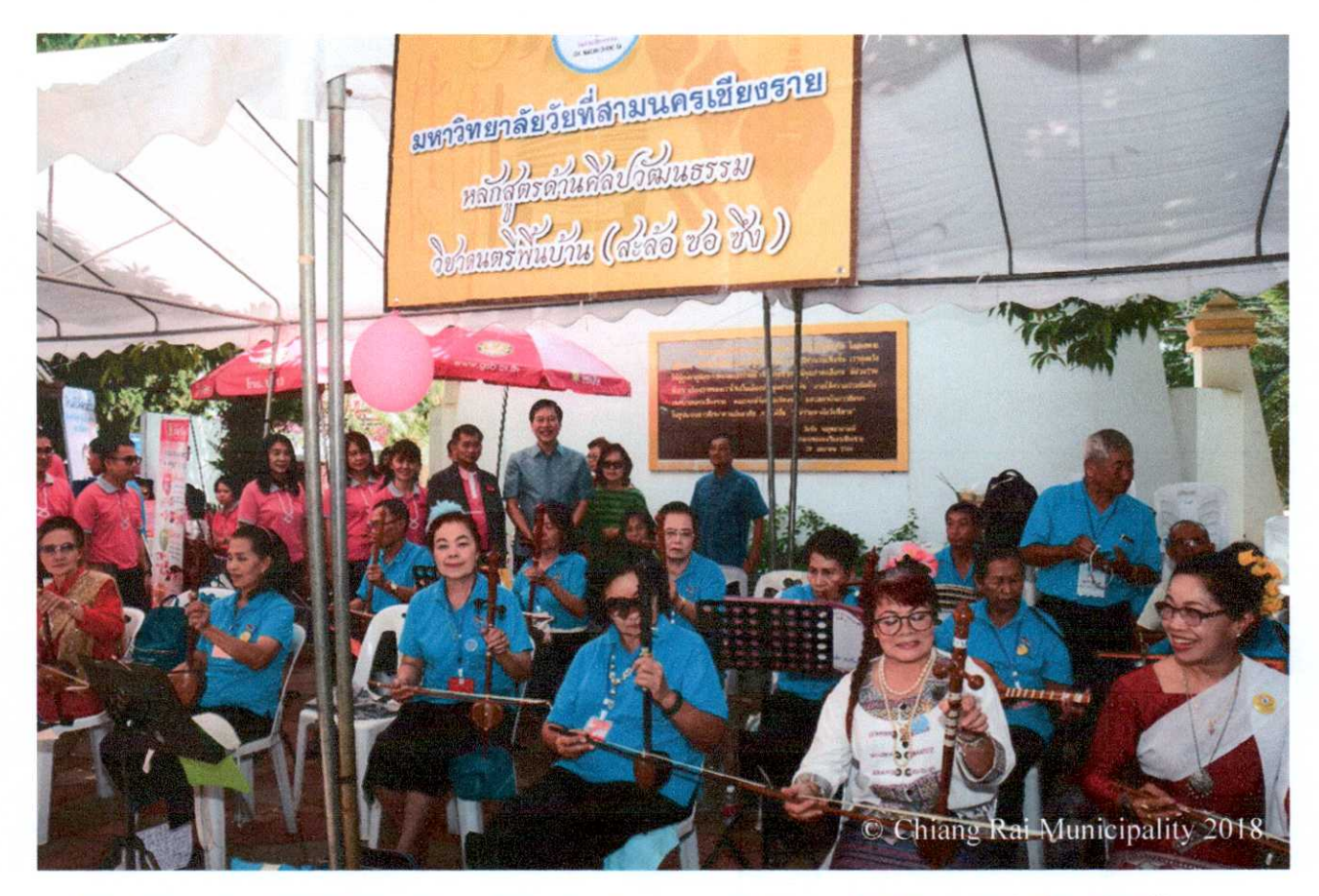
Participants were performancing with their folk music skill at Elderly Learning School. The school has many local curriculums that can offer you to join us. You will have fun and get more some learning with your friends. Also, it makes you building a relationship among others.